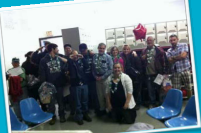
St. Patricks Day! Siskiyou Team